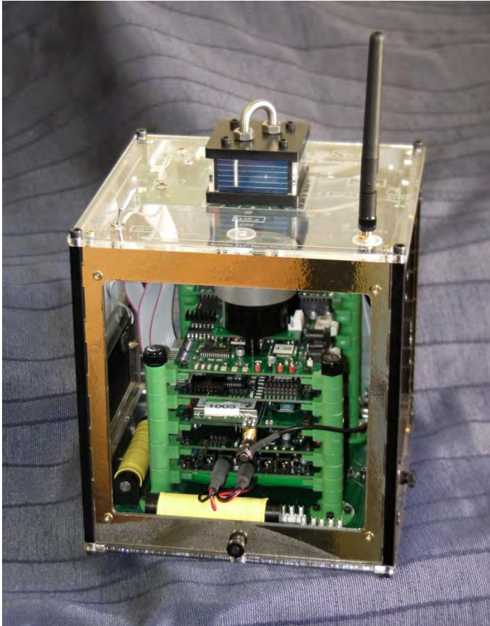
Edu_Satellite is an educational satellite that is used by the Department of Electrical and Electronic Engineering in the postgraduate Satellite System Course.

Robotics and Informatics. These tracks allow students to choose a partial focus area for their degree programme, in order to best prepare them for the requirements of modern industry and/or post-graduate study. Further details regarding the composition and goals of the directions of specialisation are provided on the following web page: http://www.ee.sun.ac.za .