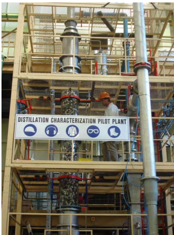
One of the distillation columns in the Department that facilitates cutting-edge research in separation technology in the chemical industry.

The Department of Process Engineering offers the Bachelor of Engineering Degree in Chemical Engineering with electives in mineral processing.